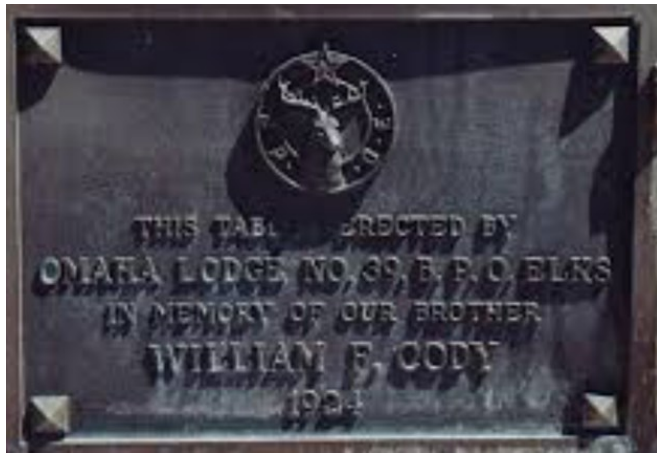
This tablet was dedicated by the Omaha Lodge #39 B.P.O. Elks In Memory of our brother William B Cody.