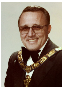
Tribute to Past Exalted Rulers